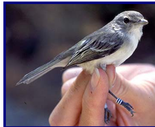
Least Bell's Vireo