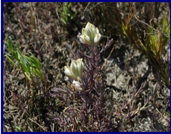
Salt Marsh Bird's Beak