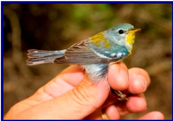
Northern Parula at banding station (2009)