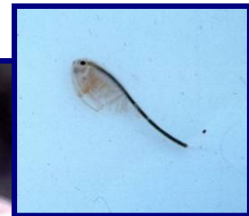
SD Fairy Shrimp